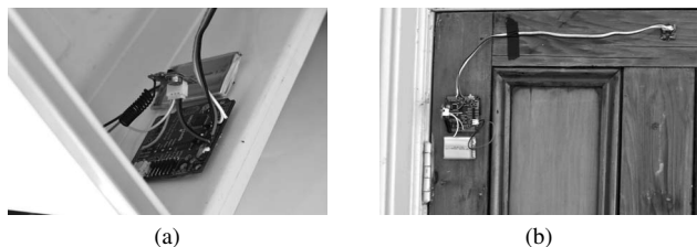
Figure 3: Two examples of the prototype sensor systems activating everyday interactions.

This history is then wrapped around to make five parallel dimensions of data, synchronised to the time of day they were recorded. Each of these is sonified using a simple algorithm, mapping the sensor output to the gain of a tone. The pitch of the tone is related to the day the data was recorded on, with the most recent day having the highest pitch, and the others descending along a pentatonic scale.